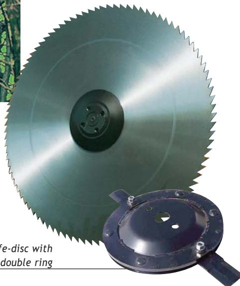
Knife-disc with double ring